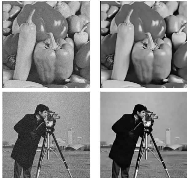
Fig. 2. Noisy Images (Left), Denoised Images (Right).

Next, we present preliminary results for our denoising framework, employing the proposed efficient closed-form solutions in transform learning. We add i.i.d. gaussian noise at noise level \sigma = 10 to the peppers image. We choose our algorithm parameters as n = 64 , \mu = \lambda = 10^6 , initial s = 0.15 \times n (rounded to nearest integer), C = 1.08 , and \tau = 0.01/\sigma . We executed our denoising algorithm for 3 iterations, each with 80 iterations of transform learning. The noisy image (PSNR = 28.1 dB) is shown in Figure 2, along with the denoised image (PSNR = 34.38 dB) obtained using our closed-form-solution-based learning via (P2). The learnt transform in this case is well-conditioned with condition number 2.28. When the learning was done using the CG-based algorithm (256 CG iterations) [6], we obtain similar denoising, but at about 2x slower speed, indicating the efficiency of the proposed exact closed-form solutions. Moreover, when our denoising algorithm is run with